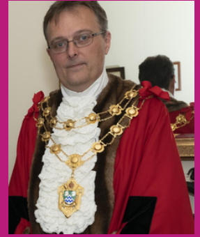
Mayor's Charity 2023-24