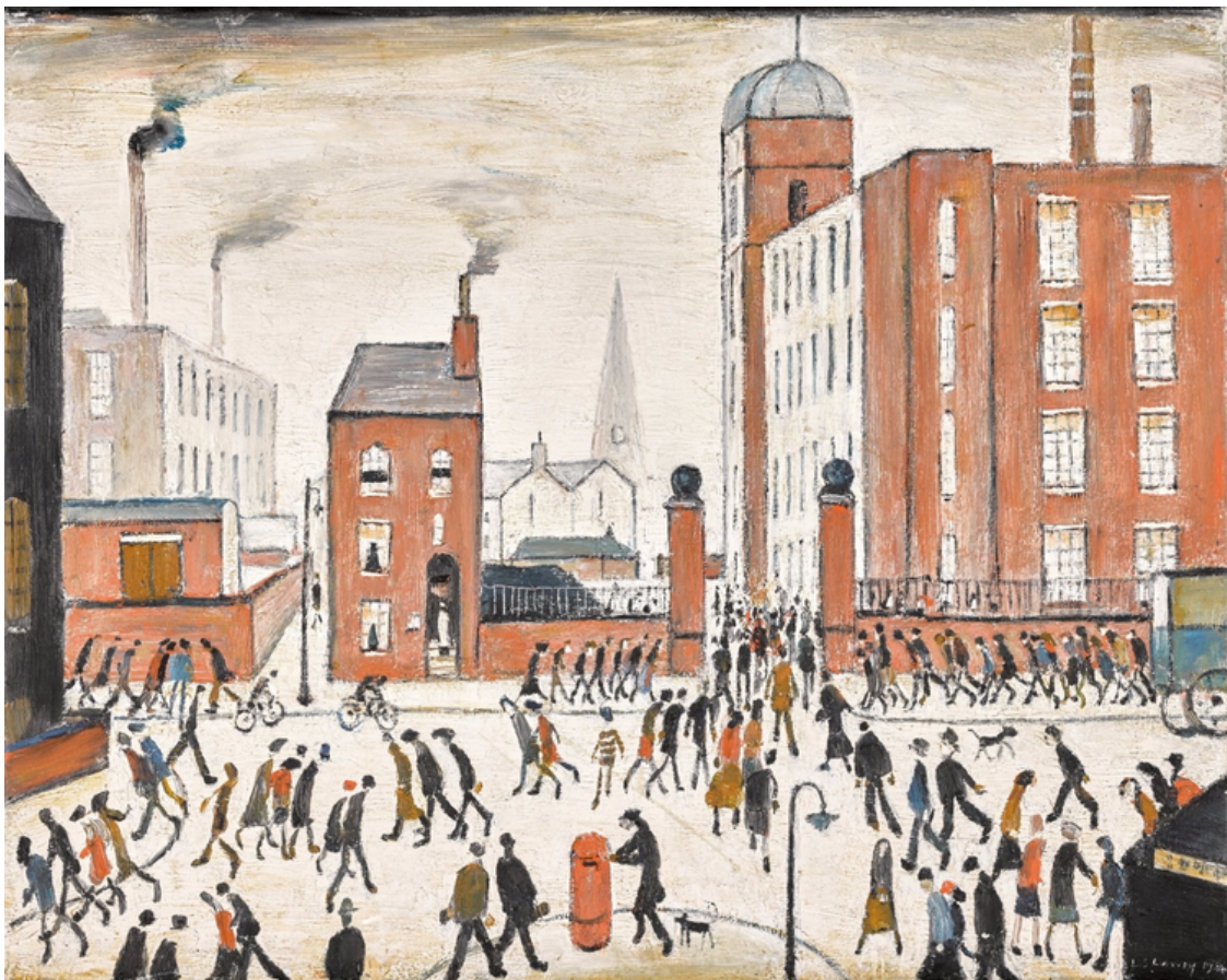
Mill Scene, 1965 L.S. Lowry